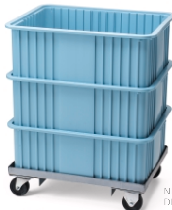
NDC3060 on DDC3000