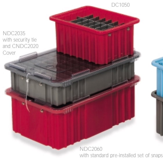
NDC2035 with security tie and CNDC2020 Cover