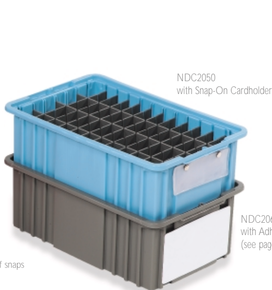
NDC2050 with Snap-On Cardholder