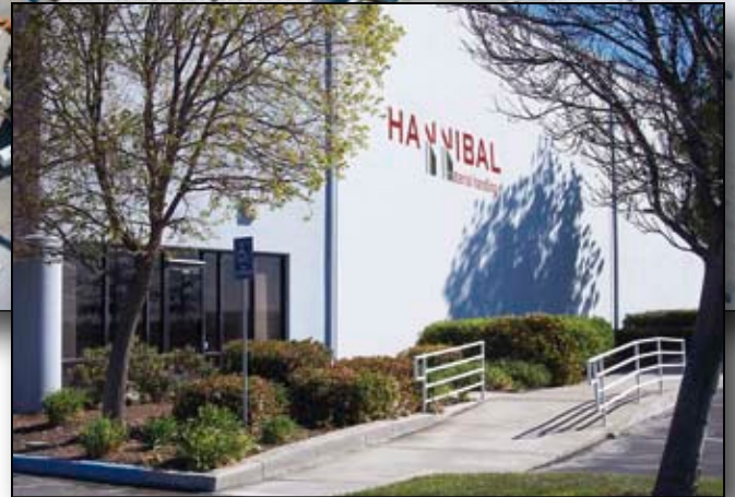
HMH Stockton Facility