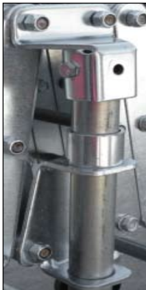
4-Point Leg Connection