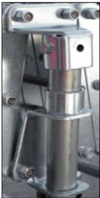
4-Point Leg Connection

The 275 features ALL BOLTED CONSTRUCTION and is a heavy duty, gravity conveyor that features DOUBLE welded cross braces and reinforced inner legs for added support. The ALL-STEEL reinforced leg and frame design provides the strength necessary to handle heavy cartons and industrial atmospheres.