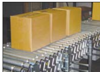
Zero Pressure Accumulation