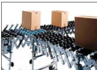
6 x 2 Caster with Brake