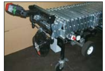
Power Assist Unit