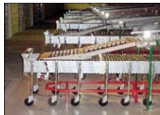
Power Truck Loader with Guide Track and Herringbone transition