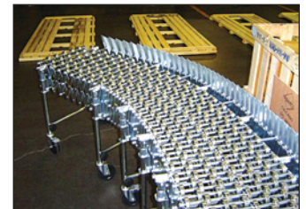
Flexible Side Rails