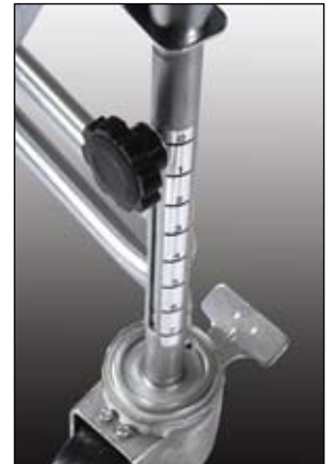
Adjustable Height Legs

medium to high volume shipping and receiving departments. Call us today to learn more at 800.669.1501 or visit our website at www.flexmh.com