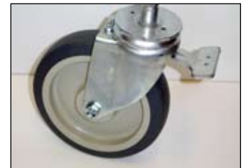
8 x 2 caster