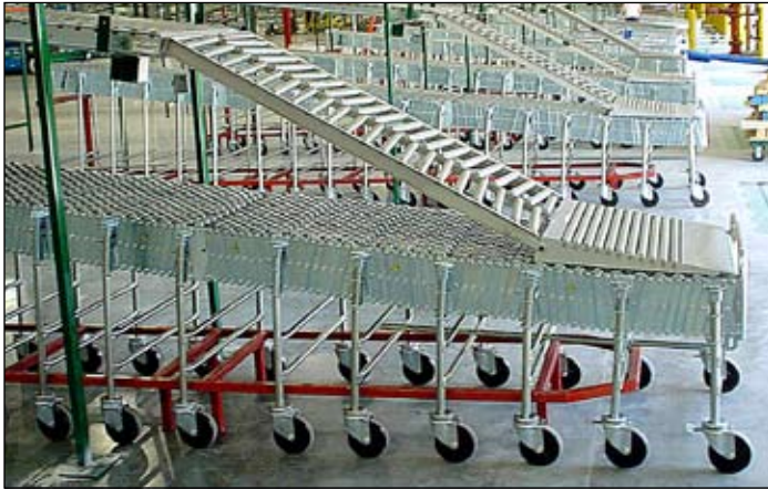
Nestaflex 375 truck loading system featured with herringbone transition and guide track system.

SMART DESIGNS COME FROM SMART SOLUTIONS.