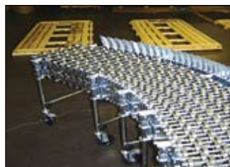
Flexible Side Rails